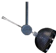
SPROCKET WITH MESH BACKLIGHT SHIELD ACCESSORY

Socket terminates with FreeJack male connector, which may be installed into a system connector. Elements ordered with a system prefix include a connector for that system.