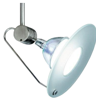
SPROCKET WITH SPY ACCESSORY