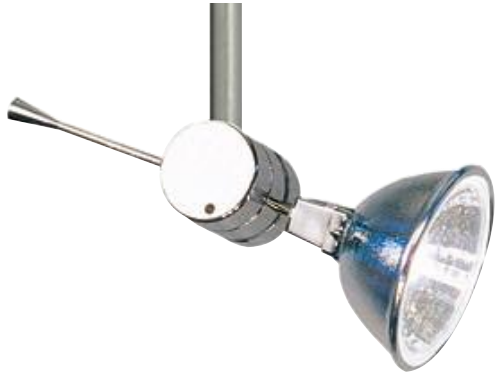
SPROCKET Shown approximately 55% actual size.