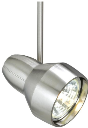
OM WITH SOLID METAL OM ACCESSORY