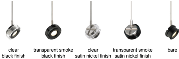
clear black finish transparent smoke black finish clear satin nickel finish transparent smoke satin nickel finish bare